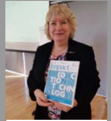
Dame Alison Peacock